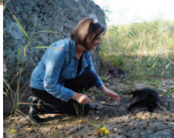
Above: Finding each other's energy, shaving Aloha; giving Huna talk, Helsinki...Visiting Tallinn, Estonia Below: Playing with "Kerttu", my host's Piiis cat beside the Baltic Sea.

Talking "Aloha" in Helsinki, finding each other's energetic fields...everything is alive, aware, reactive! Visiting Old Town Tallinn, Estonia was an experience walking through time lines that included Celtic (Druid times!), Viking, Medieval, Empire style, Scandia Stave architecture all mixed with touches of Russian onion tops and icons. From Fortress walls to ancient churches all still in good use. Beautiful days along the Baltic Sea along with great sharing of Huna, Feng Shui, and Animal Communications!