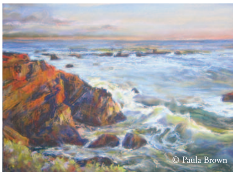
“As sunset flows” Sunset at Moonstone Beach, Cambria, CA

Also participated in the “Rejoice in Art” show in Redondo Beach. My below painting was “on the wall” in the juried show and I had a very nice art sales booth during the two day festival. Thanks for all you locals who came, made purchases, enjoyed the show!