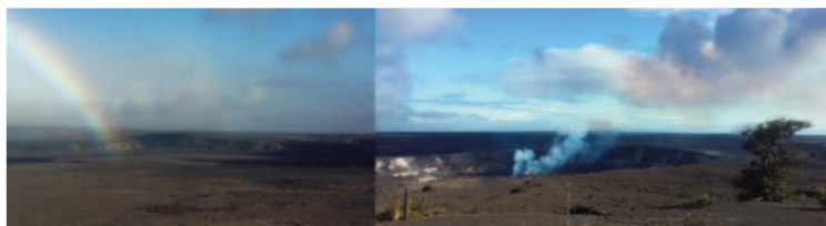
Rainbow and lava smoke cloud from the Halema’uma’u Crater (Kilauea Caldera) in Hawaii Volcanoes National Park, HA Fire and water side by side...too wide for one photo!

Thanks for reading, if you wish to unsubscribe, mail your request to me at: paula@furshui.com