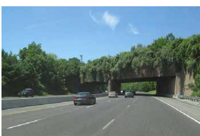
A wildlife bridge in NJ, USA

Another animal bridge article showing the benefits both people and wildlife by ArtFido : https://bit.ly/2Ubpdhj