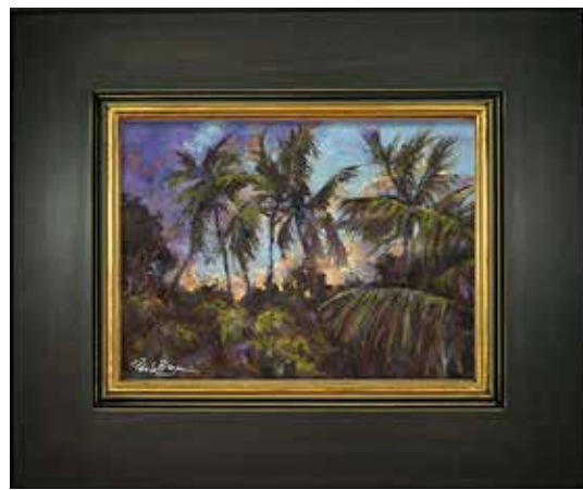
Love painting the essence of place here’s my oil: “Aloha to the Dawn”, Hawaii