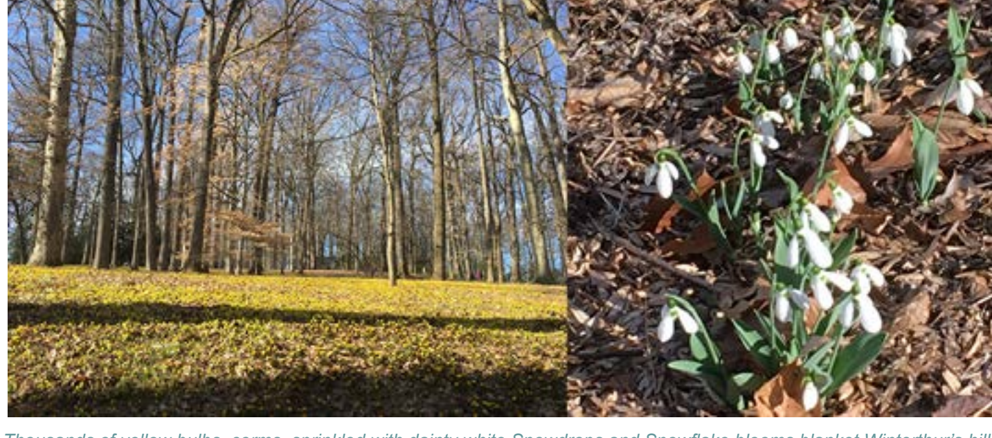
Thousands of yellow bulbs, corms, sprinkled with dainty white Snowdrops and Snowflake blooms blanket Winterthur's hills.

Go see some beauty of the Garden at Winterthur Blog: https://www.winterthur.org/category/garden-blog/