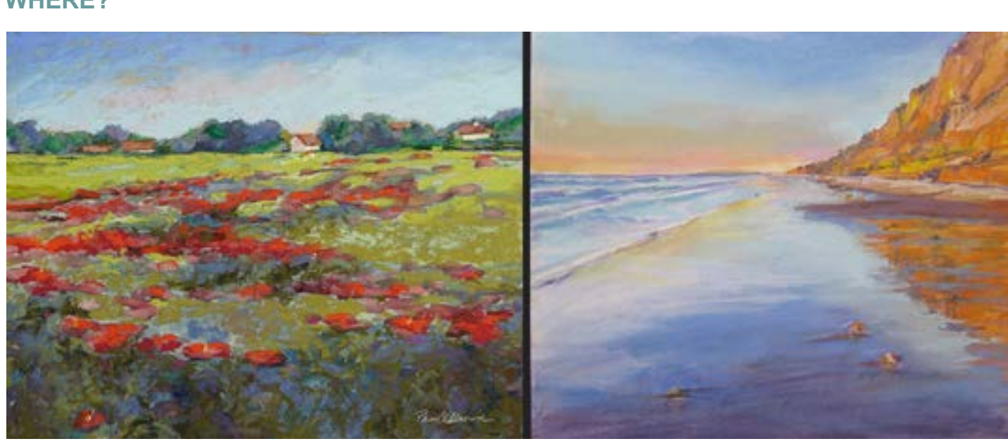
My pastels “Pop Into Spring” and “The Colors of Sunset” were juried in to the new Pastel Society of Philadelphia show!

So excited to have both my pastel paintings juried into the Pastel Society of Philadelphia spring member show! Here is: “Pop Into Spring.”, a 9x12” soft pastel done from my English Spring countryside photo.