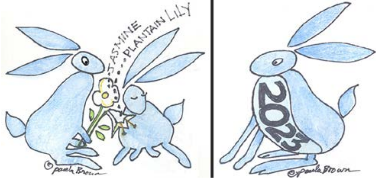
Chinese Lunar New Year of the Water Rabbit brings choice of peace, calm. Lucky plants are Jasmine and Plantain Lilly.

“Rabbit, Rabbit!” This is an old tradition said on the 1st of each month to wish people good luck. Will be trying to send out “Speak” on the first due to this being the Year of the Water Rabbit. My workshop helped ring in the Lunar New Year with blessings of peace, calm, beauty.