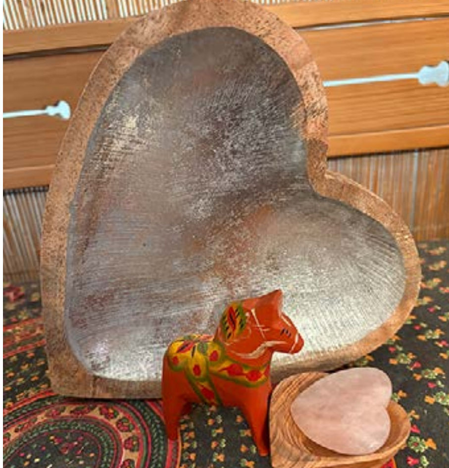
"Flame" is my Swedish new year horse. Horse is a HEART powerhouse of action no matter what nationality.

The Lunar New Year of the Fire Horse gallops in on Feb 17!