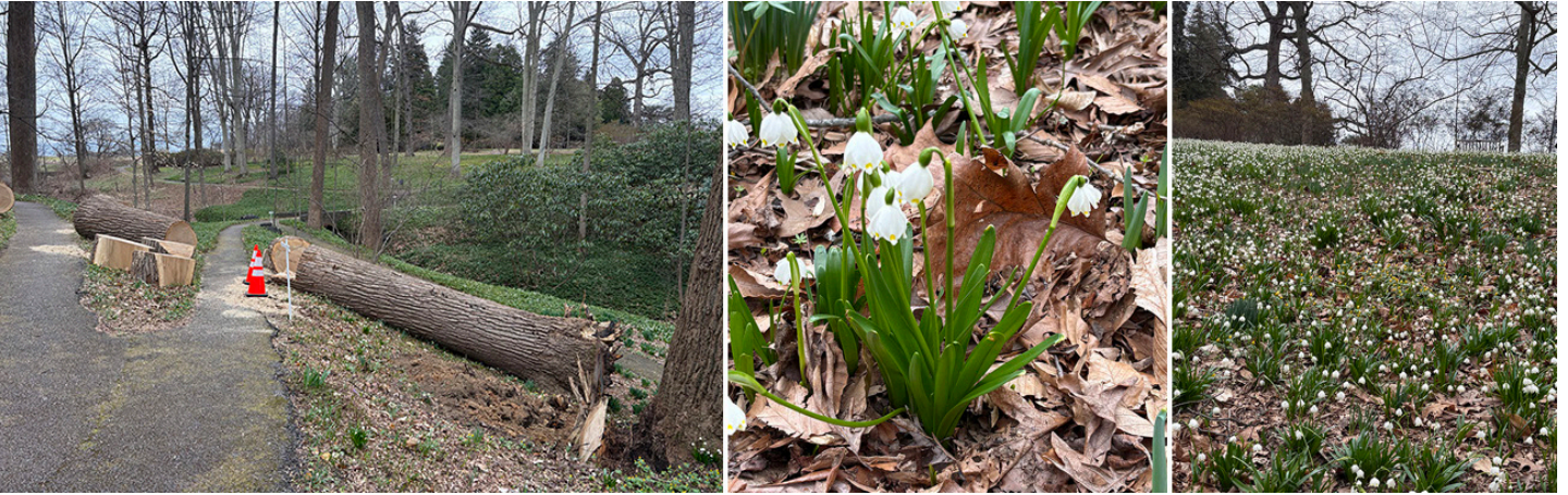
Walking in Winterthur. Thousands of snow drops are blanketing the hills celebrating Spring! We also have had tough high wind storms and many old Tulip Poplars have come down. Fallen over March Banks path!

Get out into nature, take a walk, sit, take pause and listen to what nature has to tell you. Spring has arrived as of March 20th for us in the Northern Hemisphere.