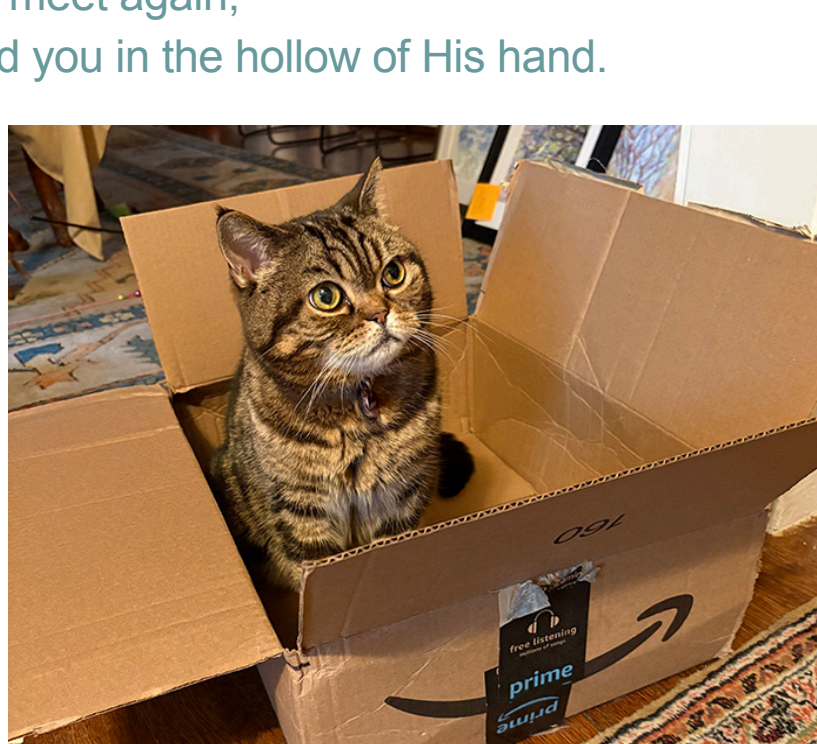
Mak the cat wants to go to Ireland, he wishes you Cheers and good Health! (He is my blessing!)

May the road rise up to meet you. May the wind be always at your back. May the sun shine warm upon your face, And the rains fall soft upon your fields. And, until we meet again, May God hold you in the hollow of His hand.